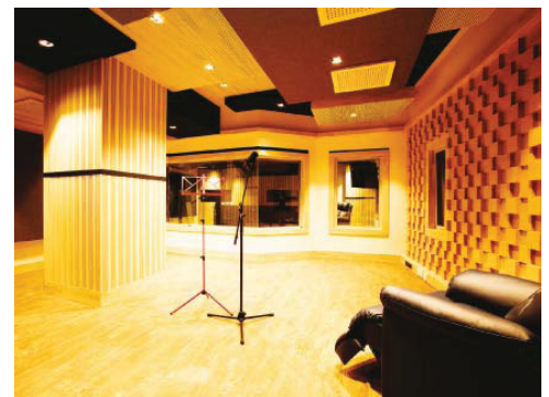
Large live area