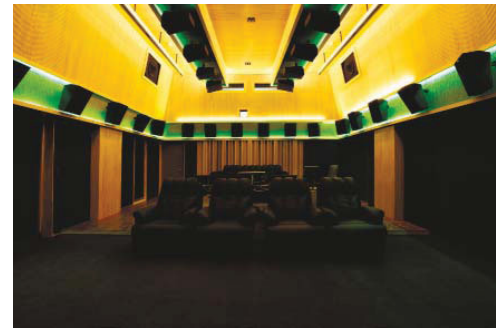
WSDG-designed Dolby Atmos room